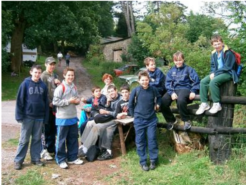
2 patrols at the Pony Trekking Centre on Summer Camp 2005.

Each patrol consists of around 6 scouts. It is led by a Patrol Leader (PL) who is helped by an Assistant Patrol Leader (APL).